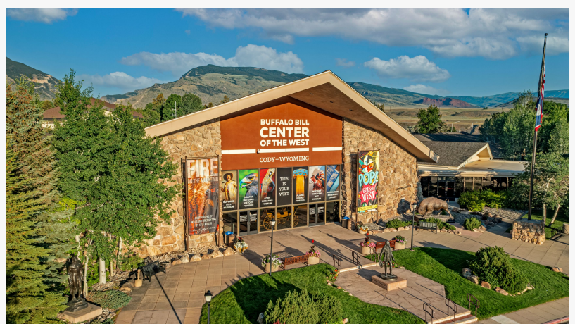
Buffalo Bill Center of the West, Cody, WY

CODY, WY, UNITED STATES, April 25, 2026 /EINPresswire.com/ -- The Buffalo Bill Center of the West proudly joins the Civilian Marksmanship Program (CMP) and the Wyoming State Shooting Complex (WSSC) in announcing a landmark collaboration that will establish Cody, Wyoming, as a premier destination for shooting sports, education, and historical interpretation.